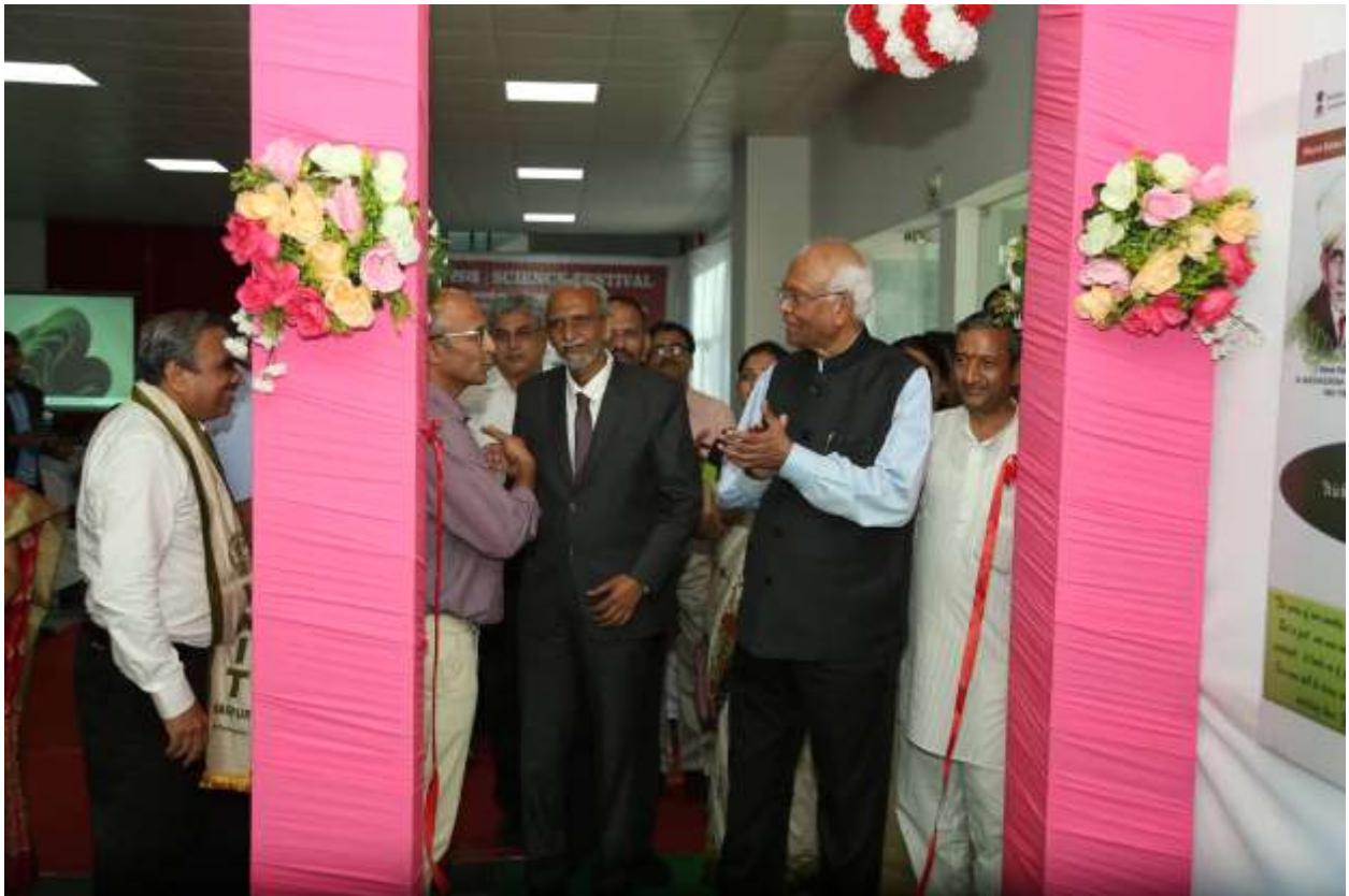
Inauguration of Poster Exhibition at the hands of Dr Raghunath Mashelkar